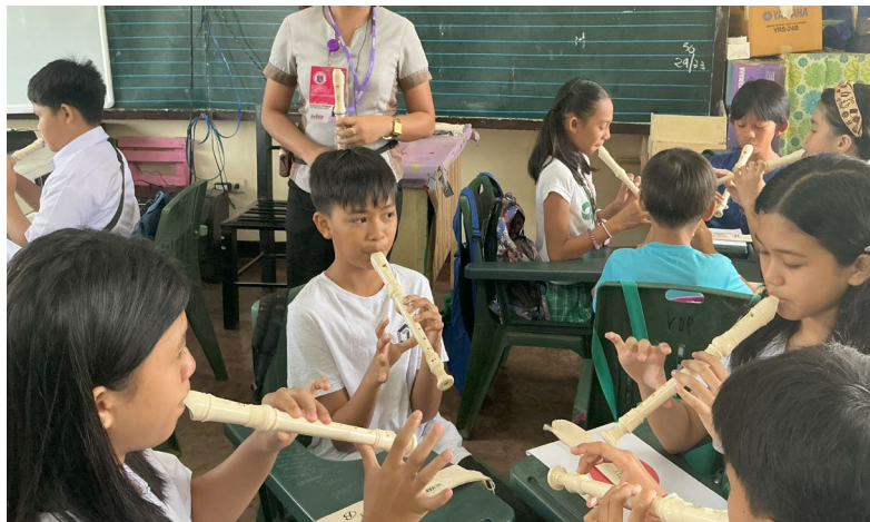
Philippines / Group Work