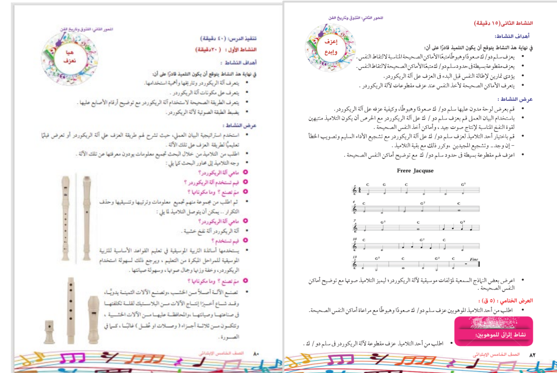
Recorder lesson from G5 Teacher's guide

◀ Workshop at teacher training colleges 2-day training for about 50 students at Helwan University in October 2024.