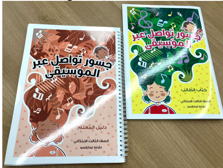
Teacher's guide / Children's book

Singing Instrumental music Music making Appreciation