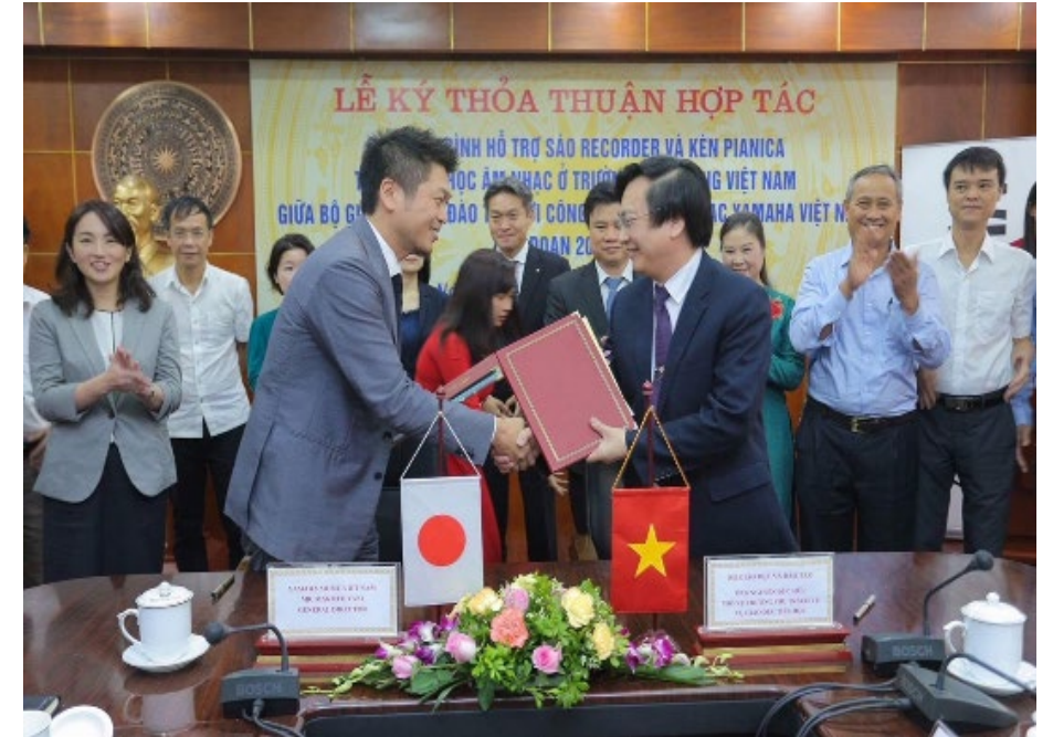
Vietnam / MoU with Ministry of Education and Training