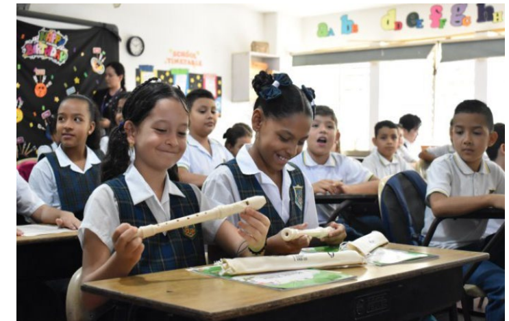
Colombia / holding a recorder for the first time