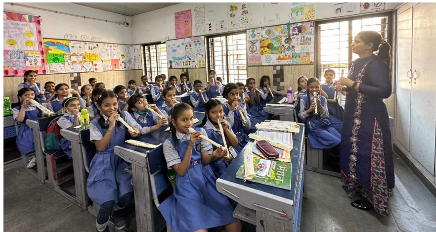
India / Recorder class in a public school