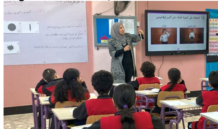
Digital Materials / Worksheets

Singing Instrumental music Music making Appreciation