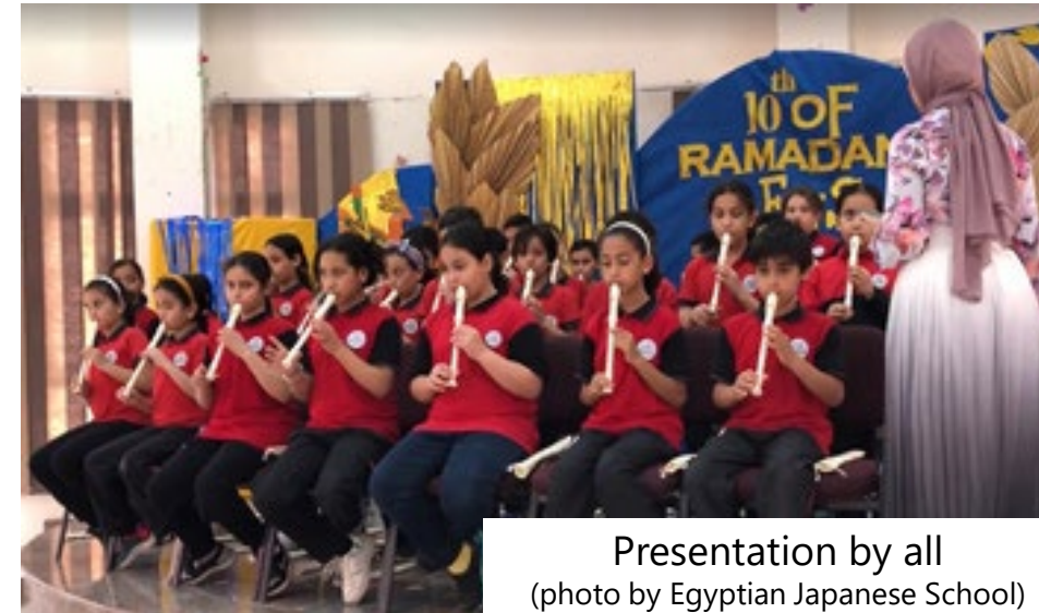
Presentation by all